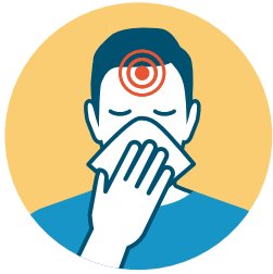
CONGESTION OR RUNNY NOSE