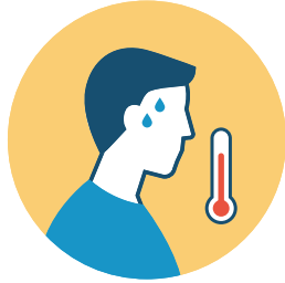
FEVER 100.4* *or school board policy if threshold is lower