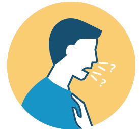
NEW LOSS OF TASTE OR SMELL

*Usually presents with more than one symptom.