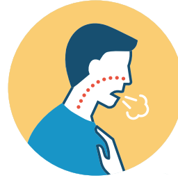
SHORTNESS OF BREATH OR DIFFICULTY BREATHING